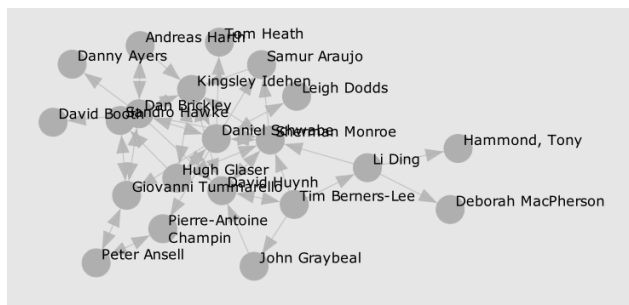
Figure 9: Identifying the network of people in a particular thread

a particular thread (in that case, from the LOD list), where we gave more weight to the edges that appear often ( i.e. , representing lots of quote/response patterns between the authors). This shows where the argumentation happens, and between which users — the edges having more weight make the nodes be closer in the graph — such patterns could have also been identified by applying an HITS algorithm to the graph [19]. In addition, we could go further and show how such patterns evolve in time, for instance to see in a community which people are involved in the discussion and how discussion moves from one sub-network to another, which might be useful when consensus must be reached in communities.