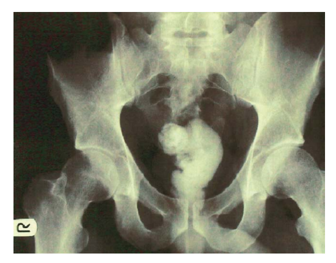
Fig. 1. Plain abdominal-radiograph showing the impacted material.