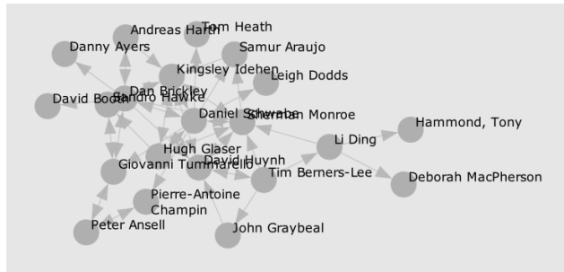
Figure 9: Identifying the network of people in a particular thread

a particular thread (in that case, from the LOD list), where we gave more weight to the edges that appear often ( i.e. , representing lots of quote/response patterns between the authors). This shows where the argumentation happens, and between which users — the edges having more weight make the nodes be closer in the graph — such patterns could have also been identified by applying an HITS algorithm to the graph [19]. In addition, we could go further and show how such patterns evolve in time, for instance to see in a community which people are involved in the discussion and how discussion moves from one sub-network to another, which might be useful when consensus must be reached in communities.